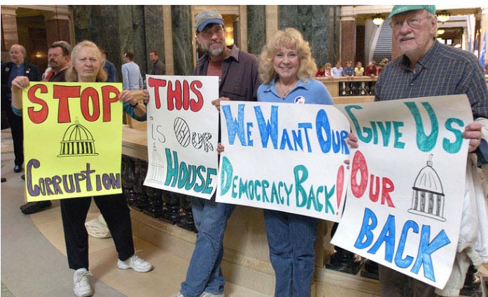
People's Legislature members gather in the Capitol rotunda before picketing the Assembly chamber in support of ethics reform