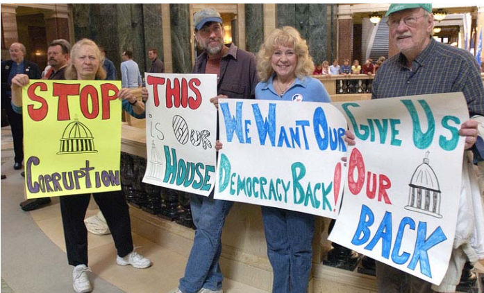
People's Legislature members gather in the Capitol rotunda before picketing the Assembly chamber in support of ethics reform