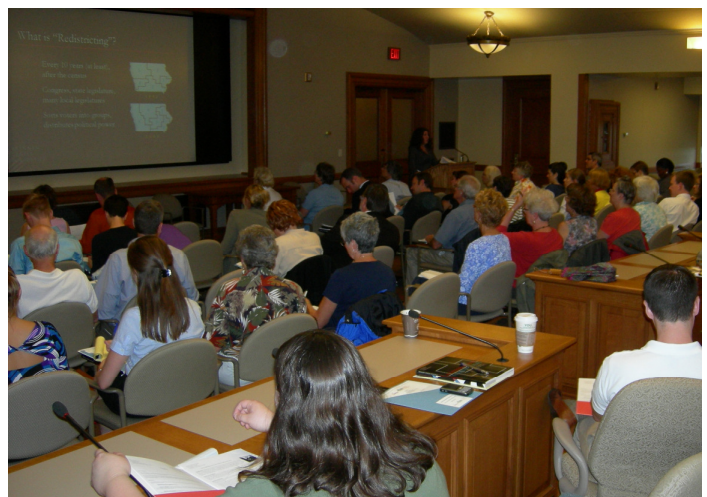
A State Capitol hearing room was filled for a July 22 educational forum on redistricting organized by WDC and partner groups.

Close to 100 people took part in a July 22 educational forum on redistricting at the State Capitol, filling a fourth-floor hearing room. The Democracy Campaign helped organize the event as part of our Campaign for Accountable Redistricting. It was co-sponsored by the Brennan Center for Justice at New York University Law School, George Mason University and the Midwest Democracy Network, of which WDC is a founding member.